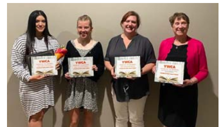
2021 Award Winners

Forms for nominations can be picked up at the YWCA or found online